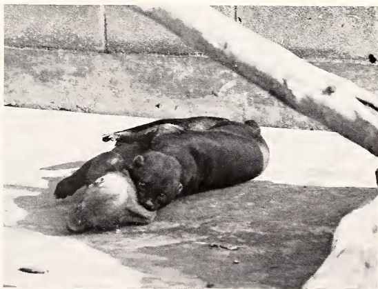
Fig. 5. Embrace. Both animals have rolled into lateral recumbency

07.45 hrs: ♀ smells at ♂'s anal region, mounts and briefly stimulates ♂, while keeping her head resting on his back; ♂ sits down, turns head to ♀ and grooms her